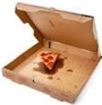
Greasy pizza boxes