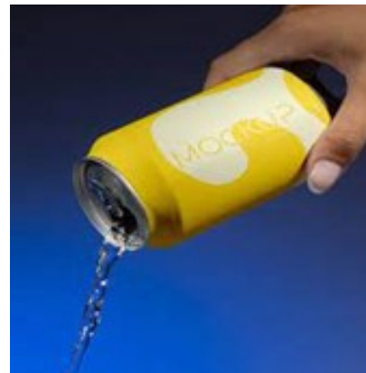
Aluminum Cans with liquid Pour out liquid before recycling

What is contamination? Contamination happens when we put the wrong things in the recycling bin. When the occurrence of contaminants in a load of recycling becomes too great the items will be sent to the landfill even though some of them are viable for recycling. This typically happens because recycling is a business: If extra costs add up simply to separate out the contamination, it is likely that a use for that money will be found elsewhere.